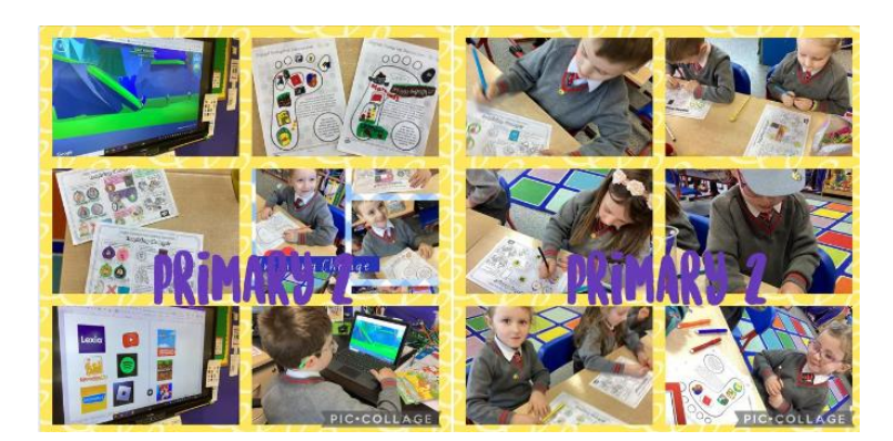
Safer internet Day Assembly and class work.