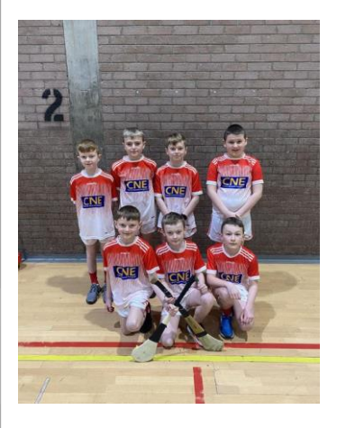
Primary Seven Boys at the indoor Hurling 7 aside