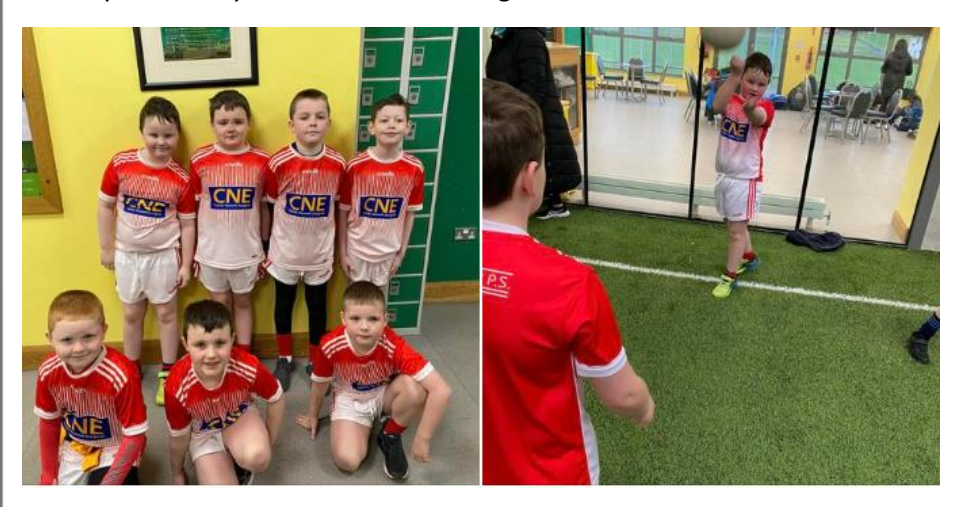
P4 boys at an indoor coaching session.