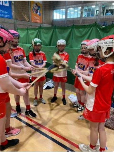
Primary Seven Girls at the Indoor Camogie 7 aside