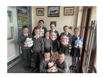
Anti- Bullying Ambassadors deliver worry teddies to every class.