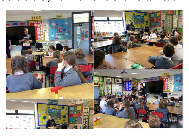
NIFRS Service Visit to P4/5